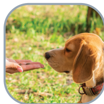
Practice when calm