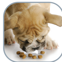
Dogs pick food options