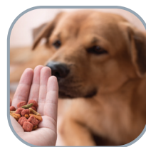
Use variety of food