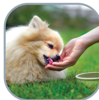
Only feed when calm