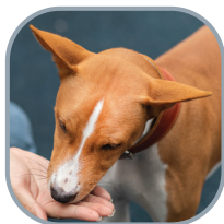
Feed off palm