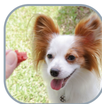
Grain-sized for little