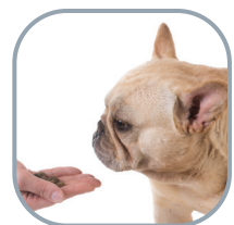
Slowly move hand